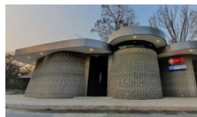
SCG 3D Printing Mortar

High quality of fiber cement board. NO.1 Brand in Thailand.