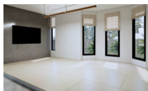
SCG Fiber Cement Board - Smartboard

Smart wall with sound blocked performance as same as traditional brick, but doubled thinner.