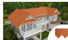
SCG Fiber Cement Roof Tile: Ayara Series

a genuine ceramic roof tile. Majestic with the exclusive properties of real ceramic offering a smooth texture and everlasting vivid color.