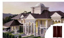
SCG Ceramic Roof Tile: Excella Grace Series

SCG 3D Printing Mortar: Product customization that suitable for various 3D printers.