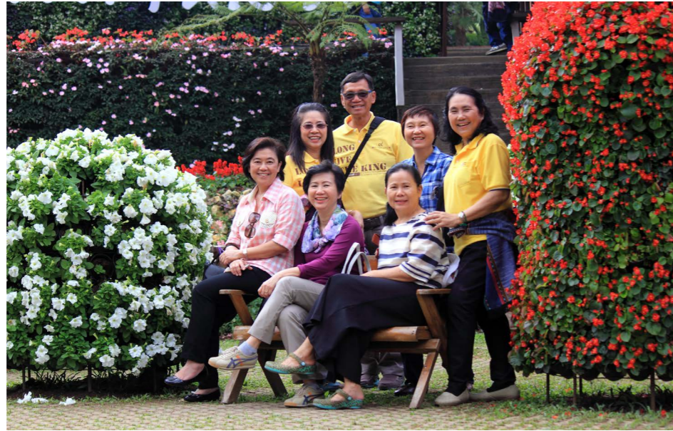
Relationship building activities for retired employees

Manager Office Supplies and Marketing Central Procurement Office